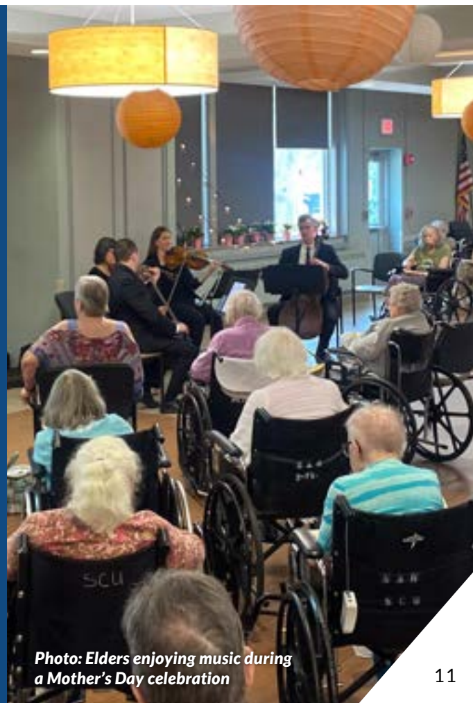
Photo: Elders enjoying music during a Mother's Day celebration

Christmas activities were bustling in our neighborhoods, households, and buildings this past year. Through the generous support of GMR Associates, RG&E, and Toshiba Business Solutions every elder across St. Ann's could participate in activities and feel the joy and camaraderie of the holiday.