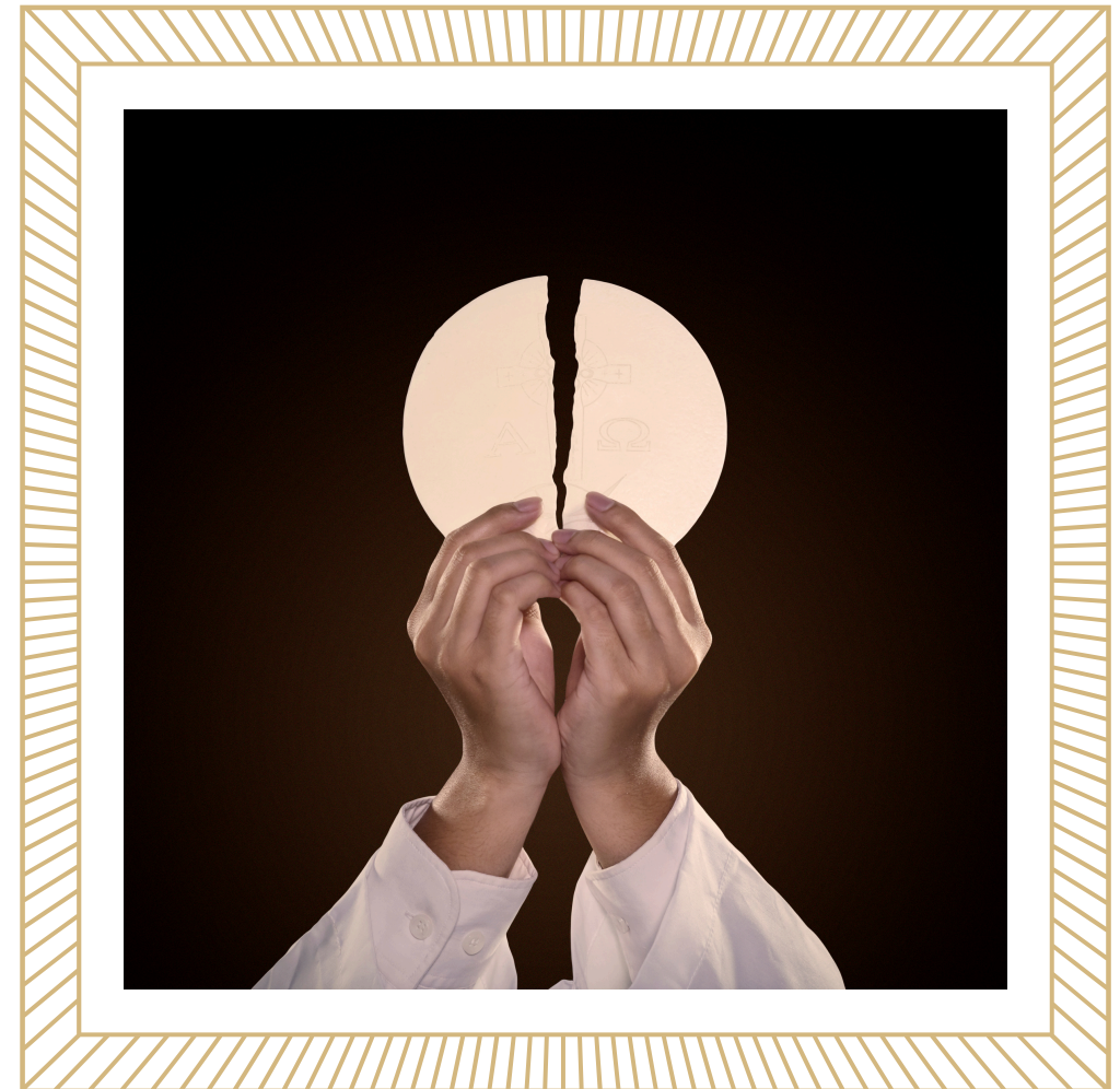
Pastoral Care Team