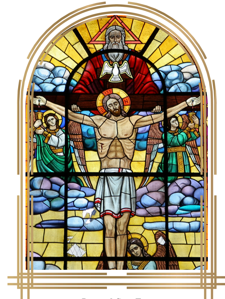
Pastoral Care Team